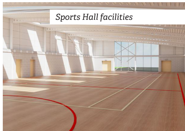
Sports Hall facilities